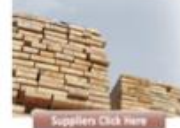
Suppliers Click Here