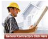
General Contractors Click Here