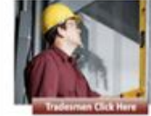
Tradesman Click Here